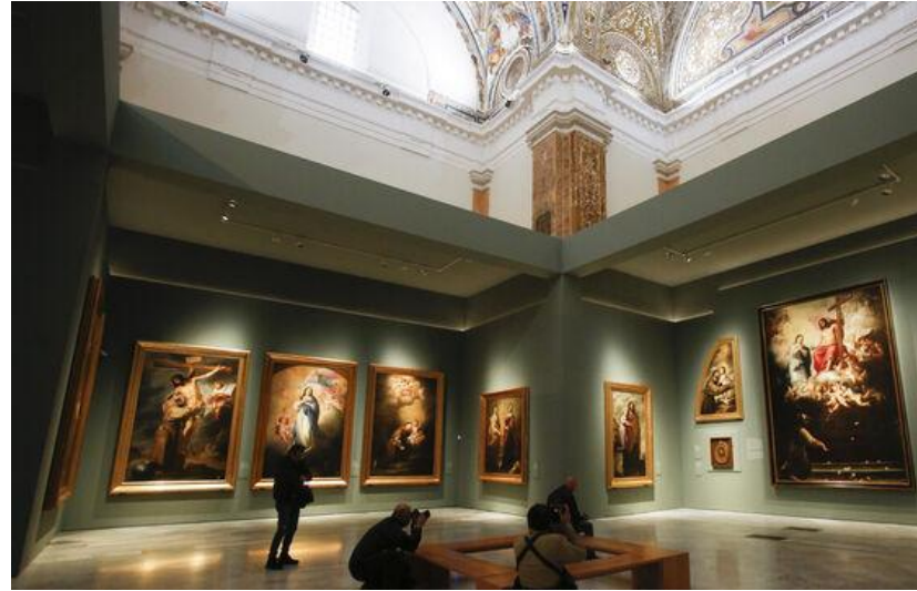
Museo de Bellas Artes