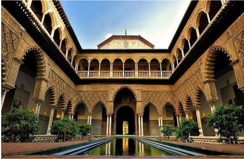
Alcázar Royal Palace